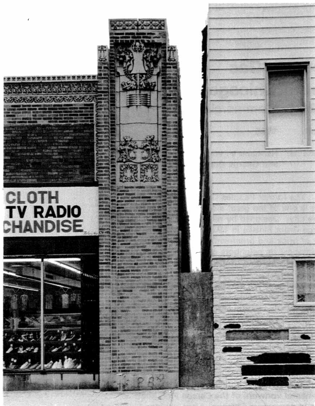
Due to its design and detailing, the People Gas South Chicago store stands out amongst its neighbors on Commercial Avenue as a building of unusual distinction and quality.

Although Elmslie is closely identified with Chicago, the city has few examples of his work. Not only is the Peoples Gas South Chicago Store one of the few Elmslie-designed buildings in the city, it is also one of his best.